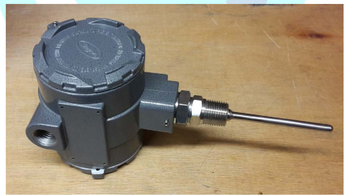
TTE series temperature transmitter with 3 inch probe and blank cover.