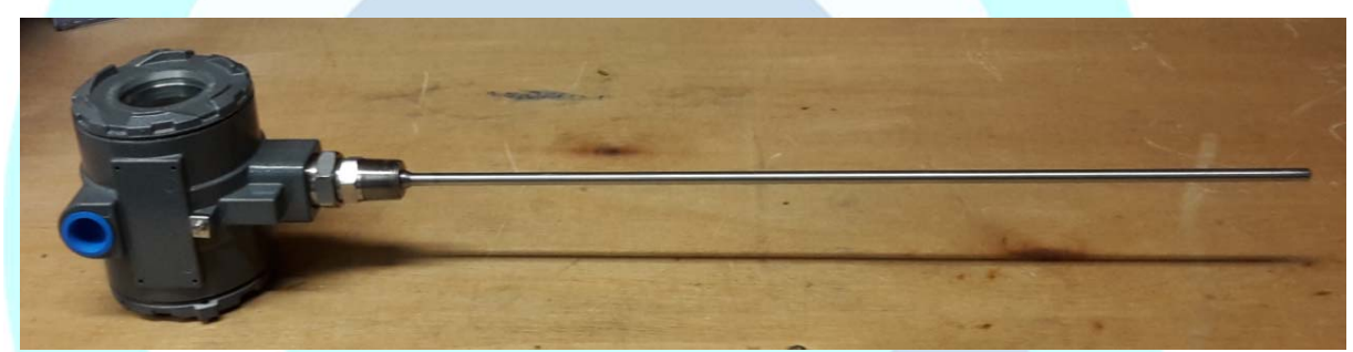
TTE series temperature transmitter with 18 inch probe and window cover with LCD display