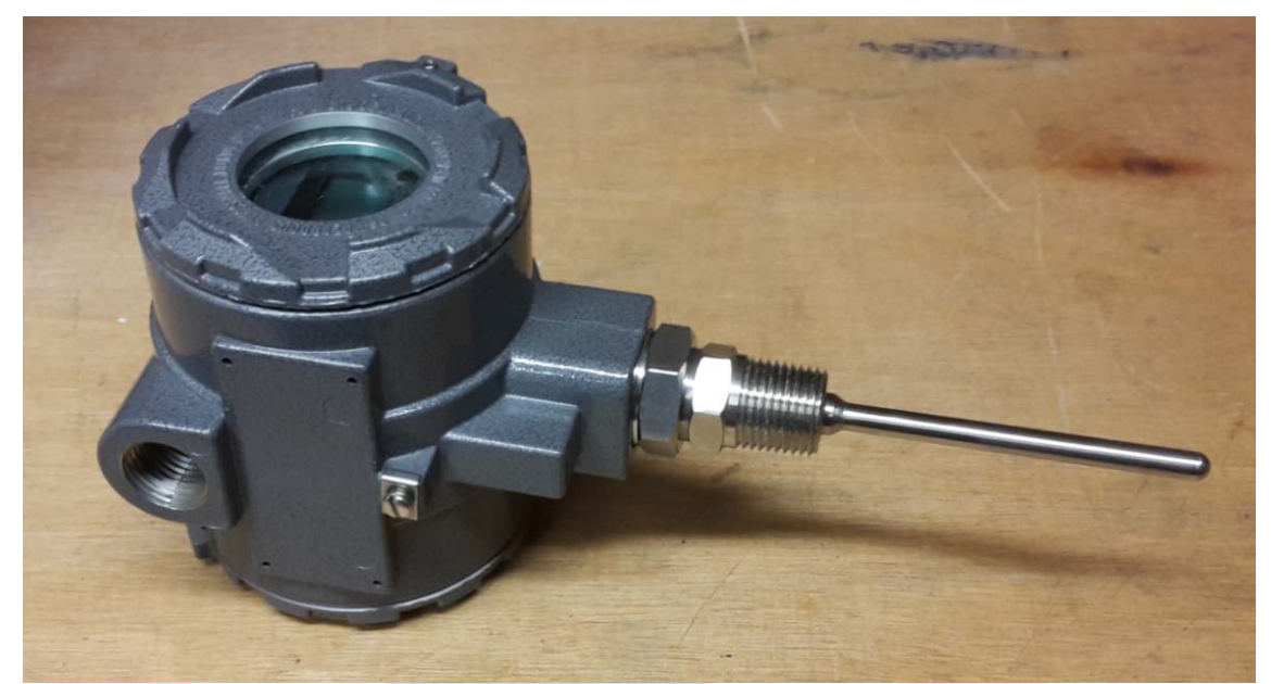
TTE series temperature transmitter with 3 inch probe and window cover with LCD display